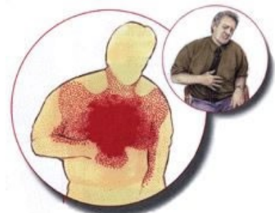
Areas of possible pain associated with a heart attack.

Not all of these symptoms occur in every heart attack.